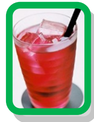
Non-Citrus Squash or Diluted Juice