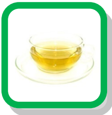
Herbal Tea For example: Camomile and Peppermint