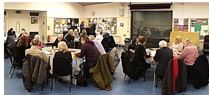
Public and patient event co-designed with University of Hertfordshire