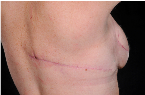
Post-operative back scar