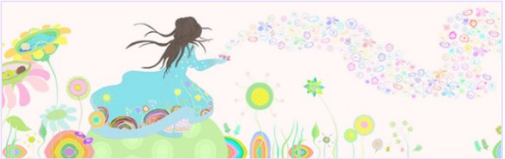
The Neonatal Unit mural commissioned by the Families Group to celebrate the lives of the babies cared for there.

On the unit you will find a Families Group leaflet with a tear-off slip for you to pass on your contact details should you wish to be involved.