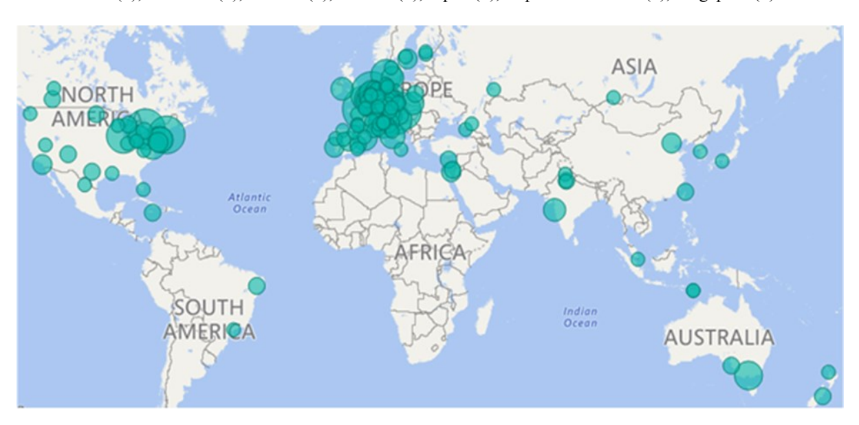
Figure 1: The worldwide distribution of the Trust's research partners based on a review of papers published Jan – Oct 2016. Each circle represents the location of a research partner and the size of each circle is proportionate to the number of papers published.

The Trust publishes research and for the period Jan 2016 – Dec 2016 produced at least 199 publications in peer-reviewed journals. Of particular note is the Trust's history of joint research which has a very strong international aspect (Fig 1). During Jan – Oct 2016, the Trust published papers with 35 different countries and the number of papers with research partners is: USA (54), Germany (36), The Netherlands (30), France (25), Italy (25), Belgium (20), Canada (19), Austria (18), Spain (18), Australia (13), Denmark (11), India (8), Switzerland (7), Poland (6), Slovenia (6), Norway (5), Sweden (5), Ireland (4), Portugal (4), Brazil (3), China (3), Czech Republic (3), New Zealand (3), Palestine (3), Russia (3), Cyprus (2), Finland (2), Israel (2), Netherlands (2), Romania (2), Taiwan (2), Indiana (1), Japan (1), Republic of Korea (1), Singapore (1).