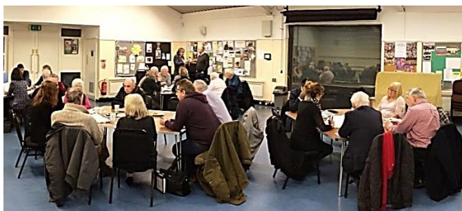
Public and patient event co-designed with University of Hertfordshire